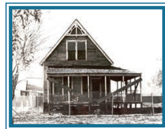
The Colony House at Strathearn Park shortly after it was moved to the Park in 1970.

Is it true that Simi Valley was originally called 'Simiopolis?' Yes! It was! The investor group in Chicago called Simi 'Simiopolis' when they were promoting Simi Valley as a place to live. It was only called 'Simiopolis' for about 6 months.