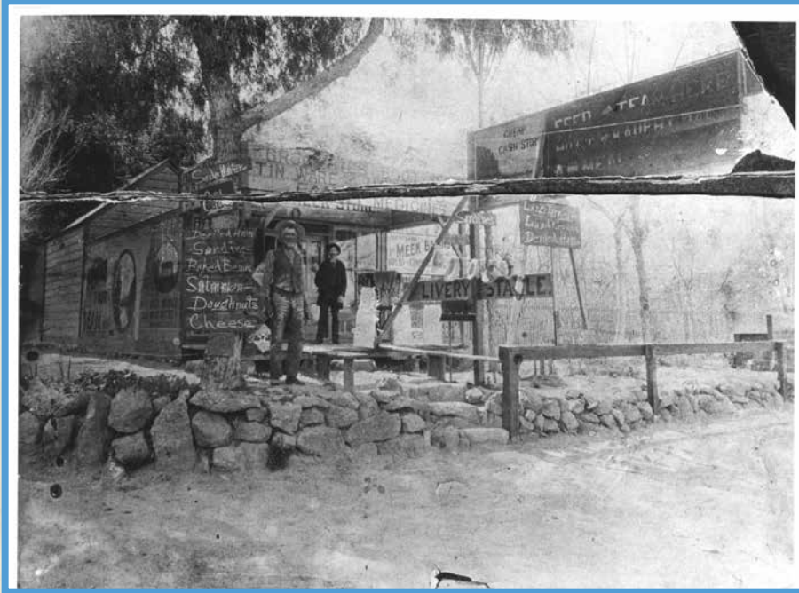
The Sawtelle Store