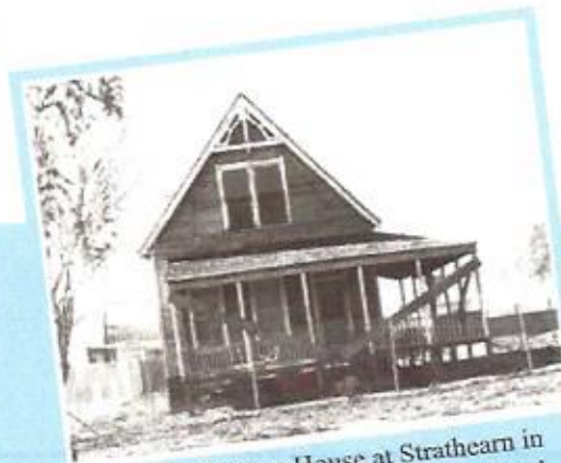
The Colony House at Strathearn in 1971. One down...one more to go!