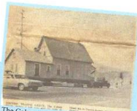
The Colony House on the move in 1970!