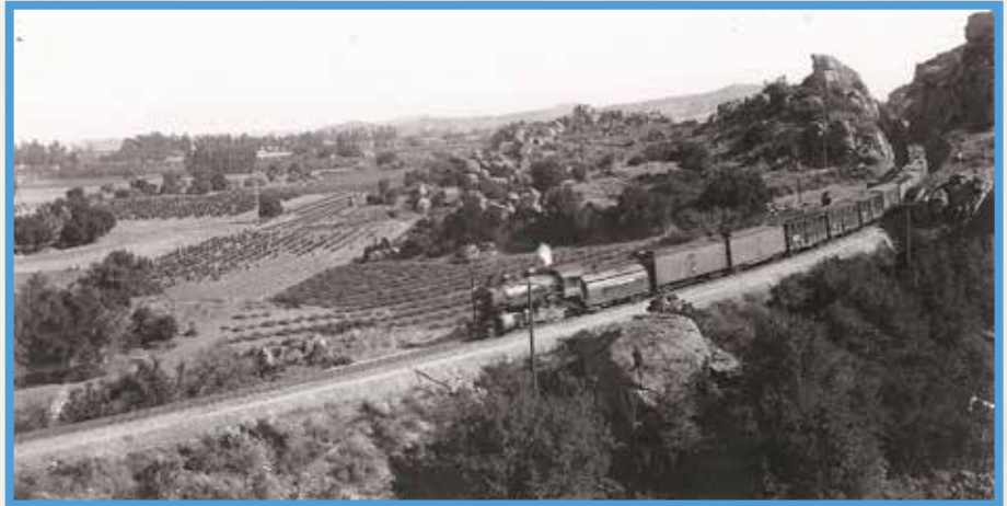
Coming out of middle tunnel Chatsworth side of pass

Three great events have contributed to the growth of the Simi Valley...The first was the railroad. At last word came that a main trunk line of the railroad was soon to come through the valley. What rejoicing this brought. This meant work for the teams and men in the valley and closer connections to the world markets. Before this, everything had to be hauled out by team and shipped by boat from Hueneme.